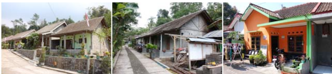
Figure 3. Regardless of typology of movement to huntap , various expanded core houses; type 1b, 2, 3.

Although residents experienced different types of movement in the resettlement phases, more research is needed before it is possible to draw any conclusions about housing form, finishes and expansion and typologies of movements. Specifically, there is a need to look more in detail at the different huntaps in the most common 1a and 1b typologies of movement in order to see what other factors may have contribute to the differences in the living environment in the huntaps . The photos in Figure 3, which include examples of houses from typologies of movement 1b, 2, and 3, show the variety among the core houses. Although the lots are more spacious in type 2 huntaps than types 1 and 3, beyond that, the ability of residents to expand/finish their houses isn't related to the typology of movement they experienced.